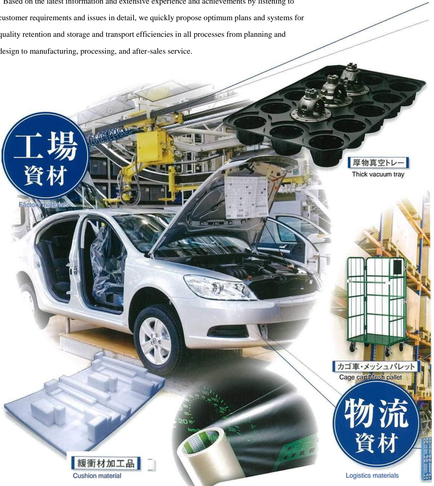
厚物真空トレー Thick vacuum tray