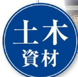
Civil engineering materials